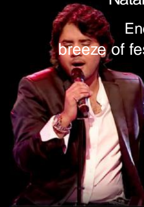
Javed Ali (Playback Singer) performing at Ignitia Celebs Night

End of Feb & March came with the breeze of festivity and gala of IGNITIA 2016. The ceremony was jollified with three day event covering celebrity night (Band ASTITVA & JAVED ALI) DJ night, Fashion show, One India One World, MNR. PSIT cultural team feels appreciative to reveal the formation of replica of coke studio that was named as PSIT STUDIO. Fine art activities were organized covering Mehendi competition, Rangoli competition, Poster painting etc. Moves and Rhythm event appreciated and welcomed the talents of other institutes as well. Finally the closing ceremony of IGNITIA 2016 was organized on 20th April 2016 with the feeling of gratitude towards all PSITians who worked day and night to make the event a grand success.