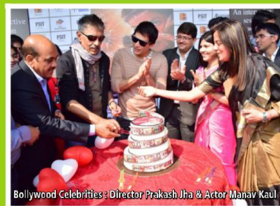
Bollywood Celebrities: Director Prakash Jha & Actor Manav Kaul

On 4th Feb 2016, renowned director Mr. Prakash Jha with his fellow actor Mr. Manav Kaul visited PSIT for the promotion of his movie "Jai Gangajal". The management of PSIT welcomed them warmly. Mr. Jha was impressed with the ambience and Hi-tech campus life of PSIT. Students were very excited & thrilled to see the Famous Director & Actor in the campus. The Trailer of the movie was displayed at the centre stage. Mr. Jha, while interacting with students,