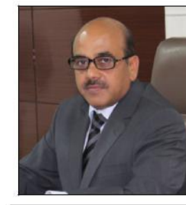
Chairman PSIT, Kanpur

I wish the team very best in all the endeavors in future.